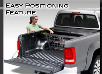
EASY POSITIONING FEATURE

CARGO MANAGER's spring-loaded control levers, located on the driver's side of the truck, enable the divider to be conveniently positioned every 3" along the bed length, without the necessity of walking to both sides of the truck.